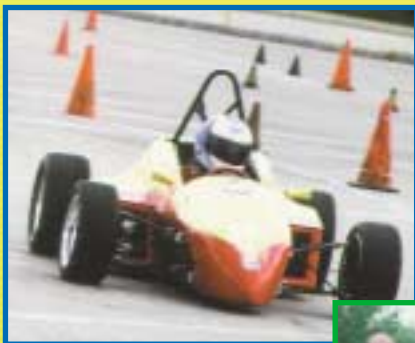
1989 - Cal State Northridge

New awards for 1989 included Safety Design, won by Cal State Northridge, and the Rookie of the Year award, won by Western Washington University. Rules changes for 1989 included the elimination of rotary engines. In the event summary report, concern was expressed about the "large number of entries" which resulted in a "shortage of time in most events."