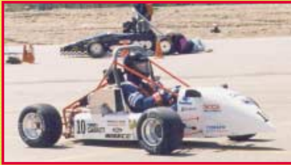
1997 - Penn State's winning acceleration run

Word of Carroll Smith's Sunday morning debrief grew from last year and many more students and faculty came prepared with video recorders and took copious amounts of notes. Carroll was almost embarrassed to note some of the nitpicky items that the top teams were being docked for - but this was a necessity as they were all superb - it was the details that determined the 1997 design winner from UT Arlington. The terms “knocked our socks off” and “that's an idea that I'd be happy to steal” were mentioned more than once.