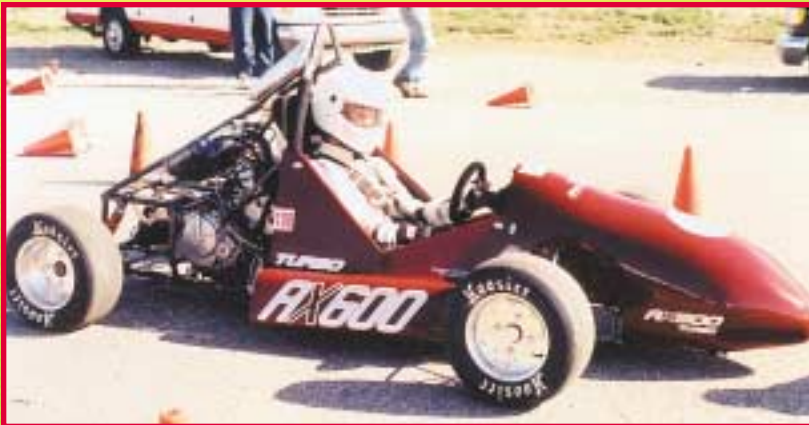
2000 – Finishing in 34th place overall, Worcester Polytechnic Institute tied with Rochester Institute of Technology for the PI Research Best Presentation Award and was honored with 2nd place for the Lear Corporation Best Interior Awards.