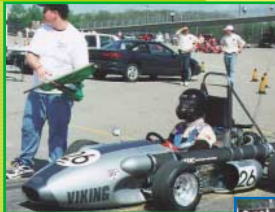
1995 - Western Washington University