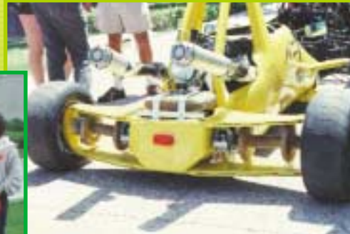
1989 - Drexel University