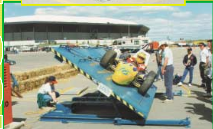
1994 - Tilt Table