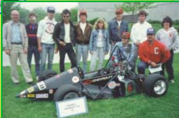
1988 - Cornell University