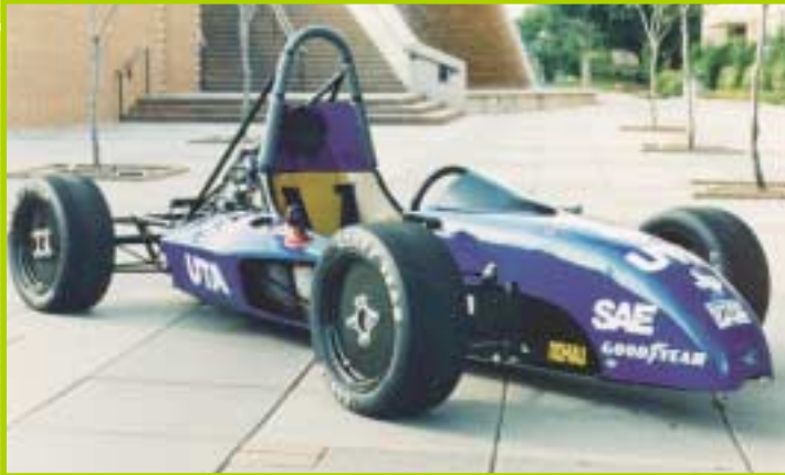
1995 - UTA

After Saturday's track events, over 300 students and volunteers gathered at the Motorsports Museum & Hall of Fame in nearby Novi. The students gathered to see the new display highlighting the SAE Collegiate design series, including both a Mini Baja® and Formula SAE racer.