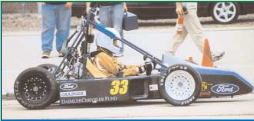
2000 – Georgia Institute of Technology finished in 24th place overall and was honored with 3rd place for the U.S. Department of Energy through Argonne National Lab M85 Awards.