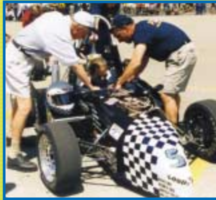
1998 - The University of Akron #5 finished in 3rd place overall and won the U.S. Department of Energy/Argonne Outstanding Teamwork Award.