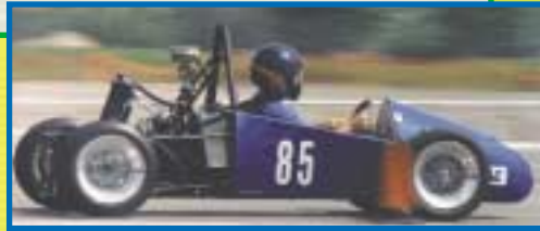
1986 - University of Texas at Arlington