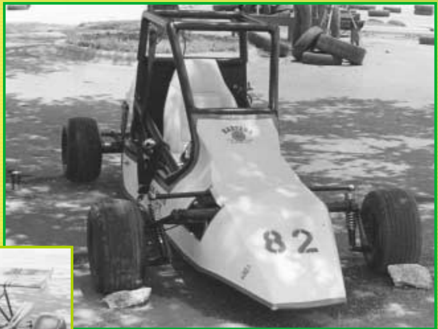
1982 - Nicholls State University