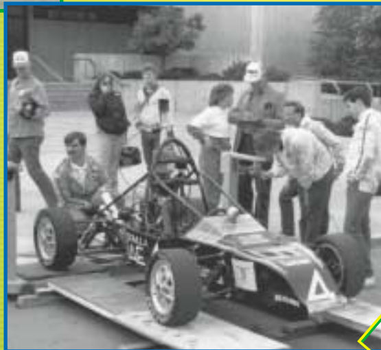
1986 - Lawrence Tech

The maximum accepted value was $4500 per unit.