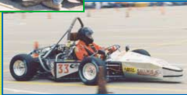
1997 - Southern Illinois Rookie of the year