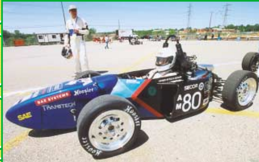
2000 – The University of Texas at Arlington won the EDS Outstanding Sportsmanship Award and finished in 15th after a disappointing performance in the endurance event due to mechanical difficulties.