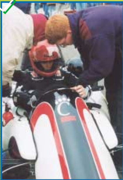
1997 - University of Cincinnati