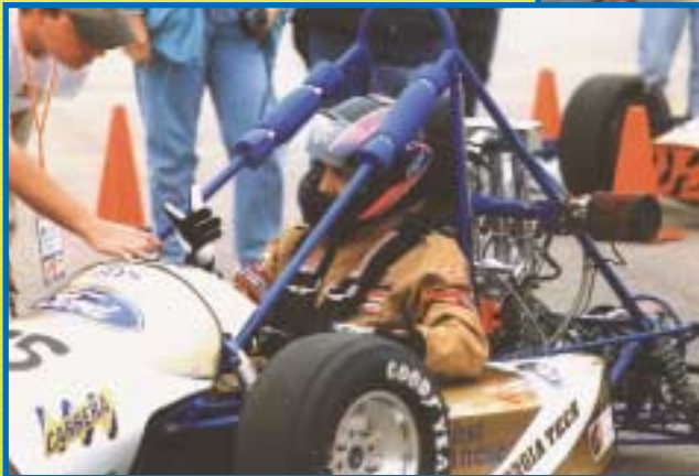
1996 - Georgia Tech