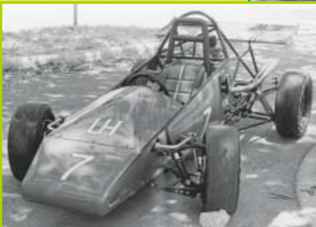
1982 - University of Houston