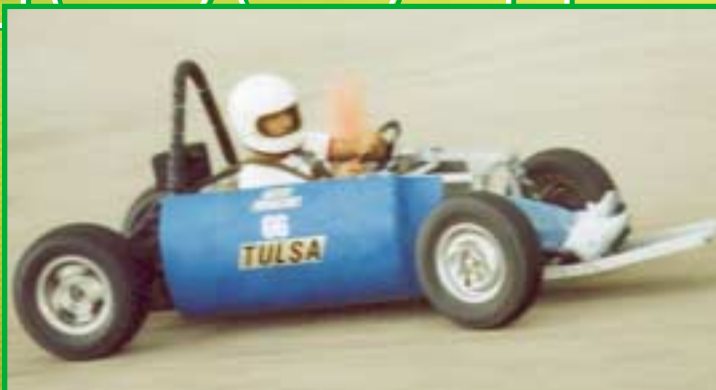
1981 - University of Tulsa