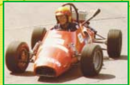
1984 - University of Texas -Austin