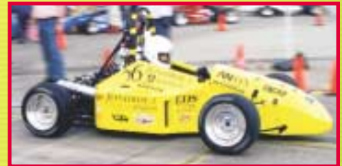
1998 - One of the Canadian teams, McGill University #26 putting "pedal to the metal" in the acceleration event.