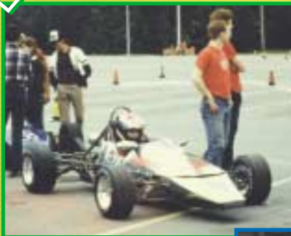
1986 - Brown University

Perhaps the biggest change was the introduction of the cost report. In 1984 the rules simply stated that "The total project cost, excluding student labor, must not exceed $2000." Now, for the first time, students were faced with submitting a report for the manufacturing costs of 1000 units.