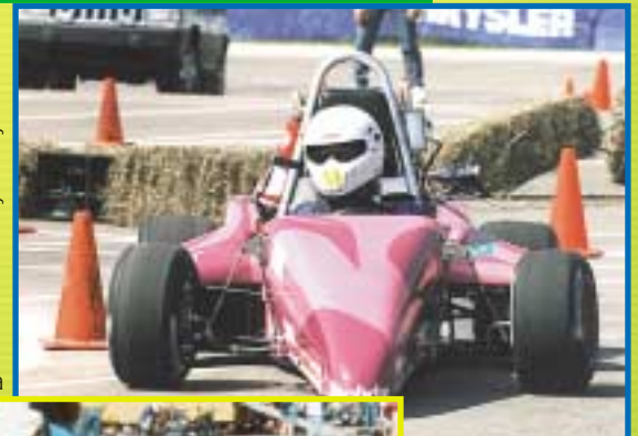
1993 University of Maryland