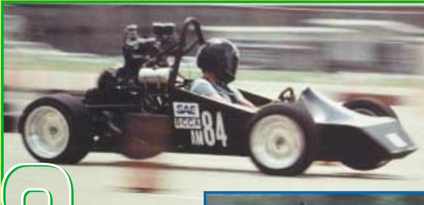
1985 - University of Texas at Arlington