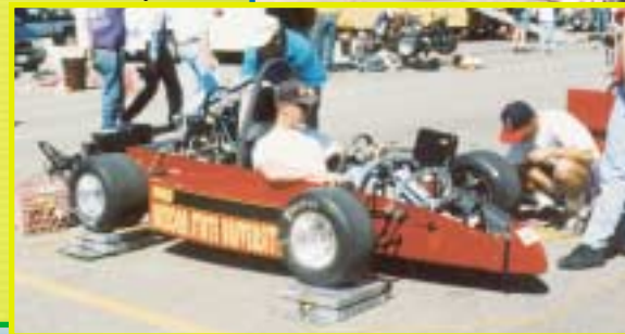
1994 - University of Arizona