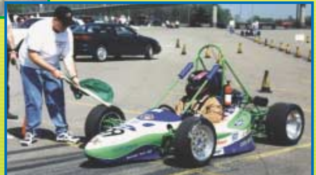
1995 - Georgia Tech