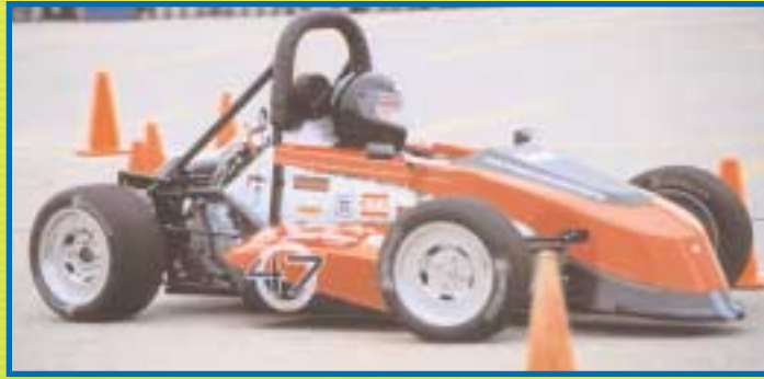
2000 - The William C. Mitchell Rookie Award went to North Carolina State University, they finished in 18th place overall by receiving points in all ten events.

Wisconsin captured the cost analysis event, while Rochester Institute of Technology won the coveted design event. RIT and Worcester Polytechnic tied for best presentation honors, while Texas A&M swept the autocross and endurance events. Five-time FSAE™ champion Cornell University turned in the best acceleration times. Like UTA, Cornell's strong performance was neutralized by a breakdown in the endurance event. Placing sixth through tenth in order were Brown University, University of Waterloo, University of Toronto, University of Pittsburgh, and Cal Poly San Luis Obispo.