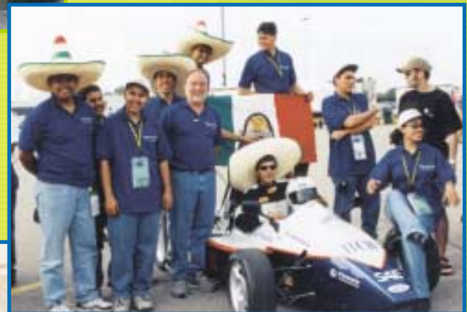
1998 - Instituto Tecnológico de Chihuahua #50 made its first FSAE appearance and was the only competitor from Mexico.