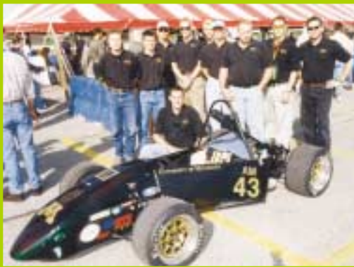
1999 – Best score in skid-pad went to the University of Minnesota-Twin Cities.