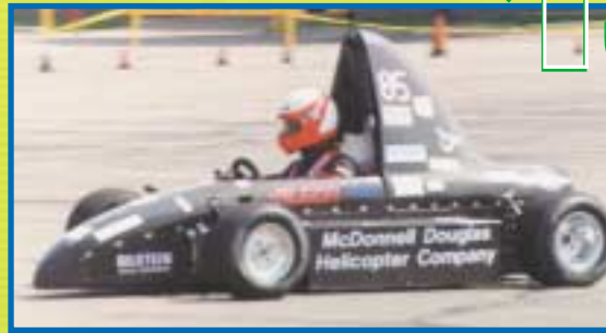
1992 Arizona State

The overall win went to the University of Michigan—Ann Arbor.