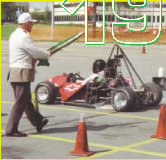
1990 - Cornell sucker car