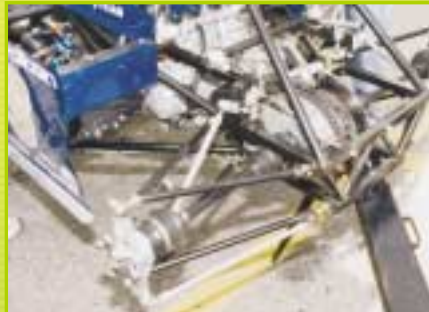
1999 – Getting a closer look at the rear suspension and drivetrain of The University of Akron's FSAE vehicle.