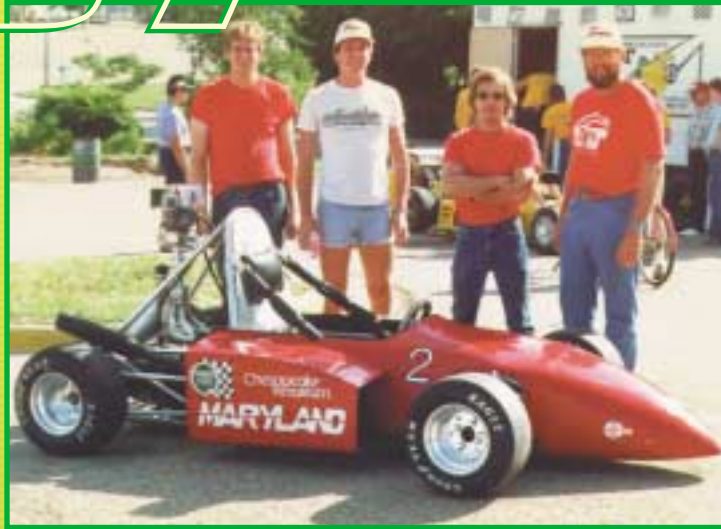
1987 - University of Maryland

There was no sophomore slump from Cornell. The team did its homework over the year and won its first Formula SAE championship. The big news for 1988 was the introduction of an official methanol fuel (M85) class. The U.S. Department of Energy, through the Argonne Laboratory, sponsored additional awards for best methanol fuel conversion, best methanol fuel economy, as well as best overall methanol placement. Now, with a strong financial incentive, teams began pursuing the methanol fuel option for their race engines. The University of Maryland won $2500 in prize money for its M85 efforts in 1988.