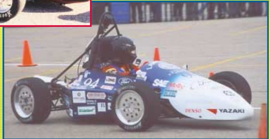
2000 – Lawrence Technological University finished in 22nd place overall and was honored with 3rd place for the Hoosier Racing Tire Autocross Awards.