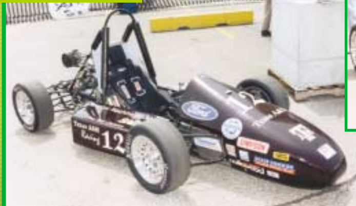
1999 – The William C. Mitchell Rookie Award for 1999 went to Texas A&M University that finished in 14th place overall. Their car also scored points in all ten events.