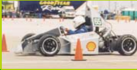
1997 - University of Leeds

The rookies from across the pond, The University of Leeds, did a credible job. The fear among some teams was that with the UK being the formula car center of the universe, Leeds would have some type of an unfair advantage. Their performance went a long way towards showing that engineering students everywhere have the same challenges - balancing project work with classwork, raising the funds and convincing their school administration of the project worthiness. The UK lads also had the issue of air freighting their car to the US. Their success (i.e. competing strongly) has resulted in SAE receiving many more inquiries from other schools beyond North America. The idea of having an overseas competition has also been raised - Formula SAE has global appeal.