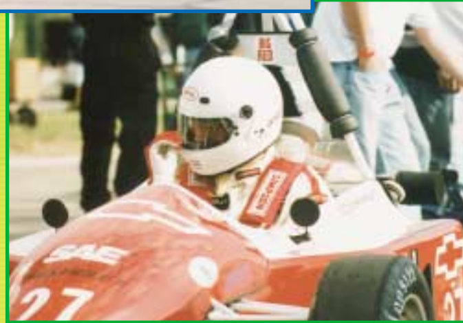
1993 - Cornell University