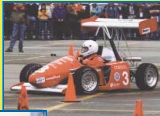
1996 - Cornell