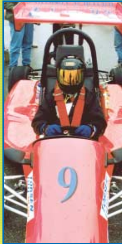
1996 - SUNY Buffalo