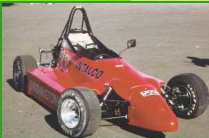
1991 - Western Washington University - The first use four wheel steering in a Formula SAE car