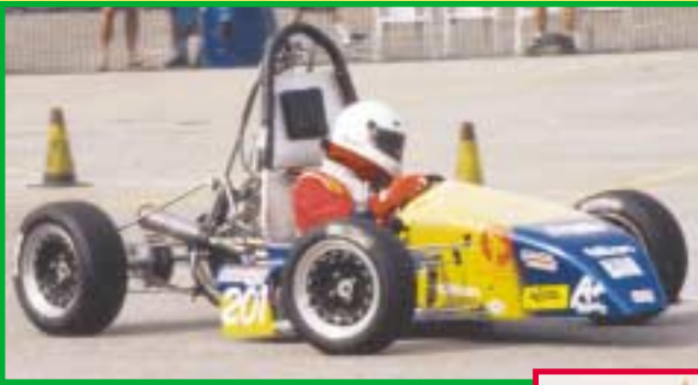
1999 – Kettering University, best cost score winner

1999 – Milwaukee School of Engineering won the Dynojet Research Highest Horsepower Award for the naturally aspirated class. Drexel University won the award for the forced induction class.