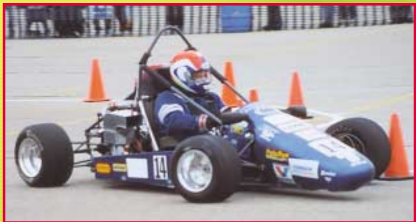
2000 – The Pennsylvania State University won the Dynojet Research Highest Horsepower Award with their forced induction engine and finished in 27th place overall.