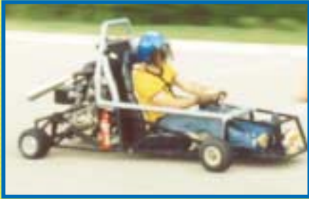
1981 - Stevens Institute of New Jersey