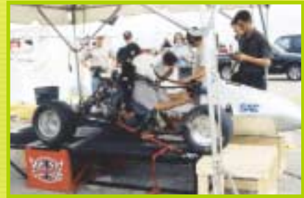
1998 - A competitor gets a free ride on the dyno compliments of Dynojet Research.