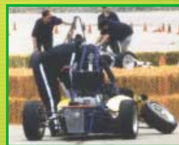
1998 - Another "learning experience" at FSAE.