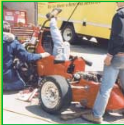
1997 - Colorado State